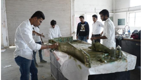
Workshop Lab: Machine shop section (View-2)

Workshop Lab: Machine shop section (View-1)